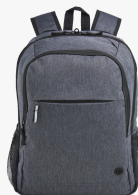
HP Prelude Pro 15.6-inch Backpack 4Z513AA