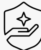
3-year pickup and return U4819E