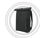
Lenovo IdeaPad Gaming Modern Backpack