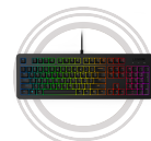
Lenovo Legion K310 RGB Gaming keyboard