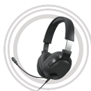
Lenovo Ideapad Gaming H100 Headset