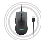
Lenovo M210 RGB Gaming Mouse