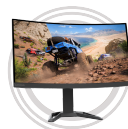
Lenovo Legion Y27h-30 Monitor